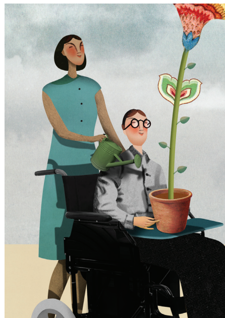
Illustration by Brett Ryder

Small Business Tax Credits December 2010