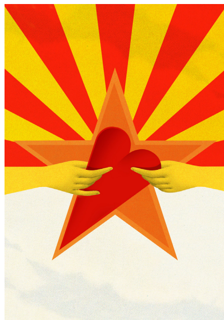
Illustration by Brett Ryder

Rebalancing Medicaid Long-Term Services & Supports September 17, 2015